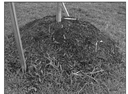
Too much mulch

7. The tree is improperly mulched or not mulched at all: Not mulching is one of the worst practices when planting a tree. Mulch buffers the environmental fluctuations of our climate and keeps competition at bay. It keeps